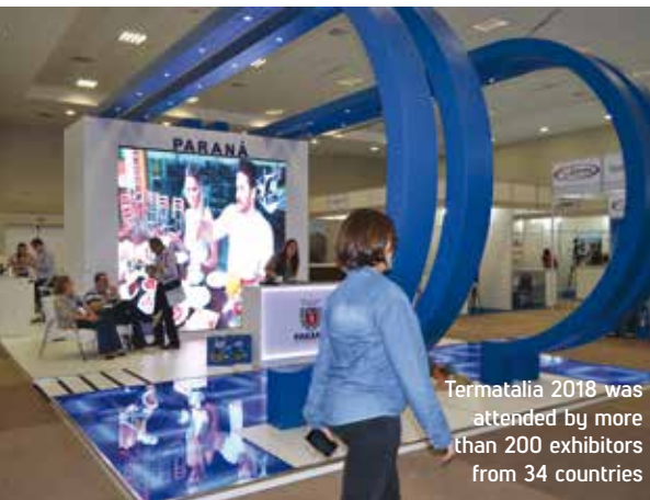
Termatalia 2018 was attended by more than 200 exhibitors from 34 countries